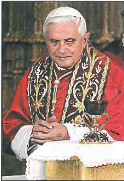
Pope Benedict XVI in 2006 in Valencia, Spain with the Holy Grail

The Eucharistic miracles shown in this exhibition have all been recognized by the local bishops, some miracles were also recognized with papal bull but not all the miracles were recognized also by the