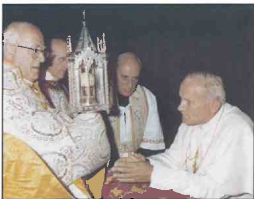
Pope John Paul II in 1980 at Siena in adoration in front of the miraculous Hosts

"The Real Presence of Jesus Christ with His glorified Body is beyond the realm of purely sensory experience. The Eucharistic miracles, on the other hand, are extraordinary events concerning the Bread and Wine consecrated at Mass which can be experienced through the senses. They become a visible sign of the Real Presence of Jesus...By the way, as we shall see, a number of these miracles are continuing right through to the present time. Furthermore, at Fatima, at Lourdes and elsewhere, Eucharistic miracles also continue to take place even though they are not always officially recognized by the Church, but 'How difficult it is to demonstrate the historical veracity of so many Eucharistic miracles. How difficult to grasp their real nature. How hard, if not possible, to dis-