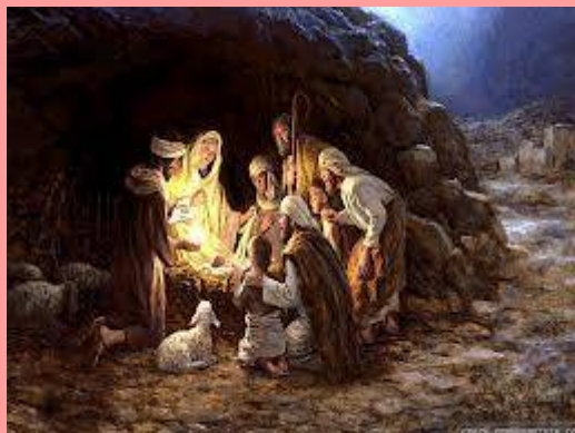
The Gift of Christmas

Pope Benedict XVI's Prayer Intention for December: Christ, light for all humanity. That Christ may reveal himself to all humanity with the light that shines forth from Bethlehem and is reflected in the face of his Church.