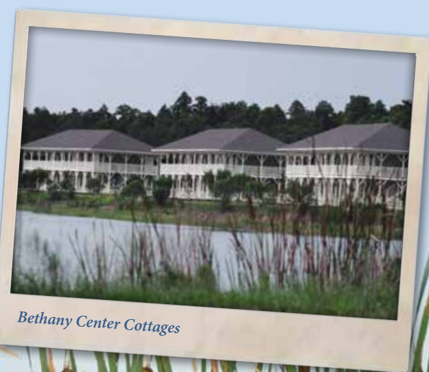
Bethany Center Cottages

The Mission of Una Fides is to build the Body of Christ by encouraging Catholic men and women to enrich, fortify, and embrace their faith through prayer, study, and fellowship.